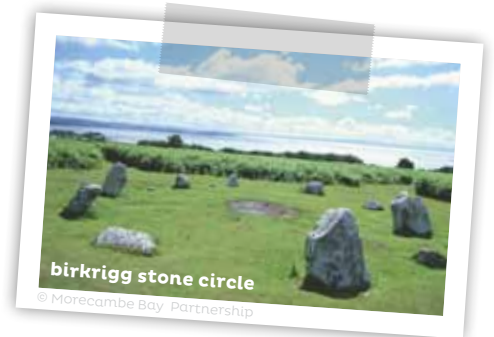
birkrigg stone circle

There is a great choice of accommodation in and around Barrow, with camping on Piel Island, and comfortable hotels and inns in the town. Call Barrow Tourist Information Centre or visit www.golakes.co.uk .