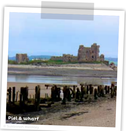
Piel & wharf

massive flocks of curlew, knot and oystercatchers are mesmerising to see. THE ISLAND MAY BE CUT OFF AT HIGH TIDE. Check tide times at www.tidetimes.org.uk