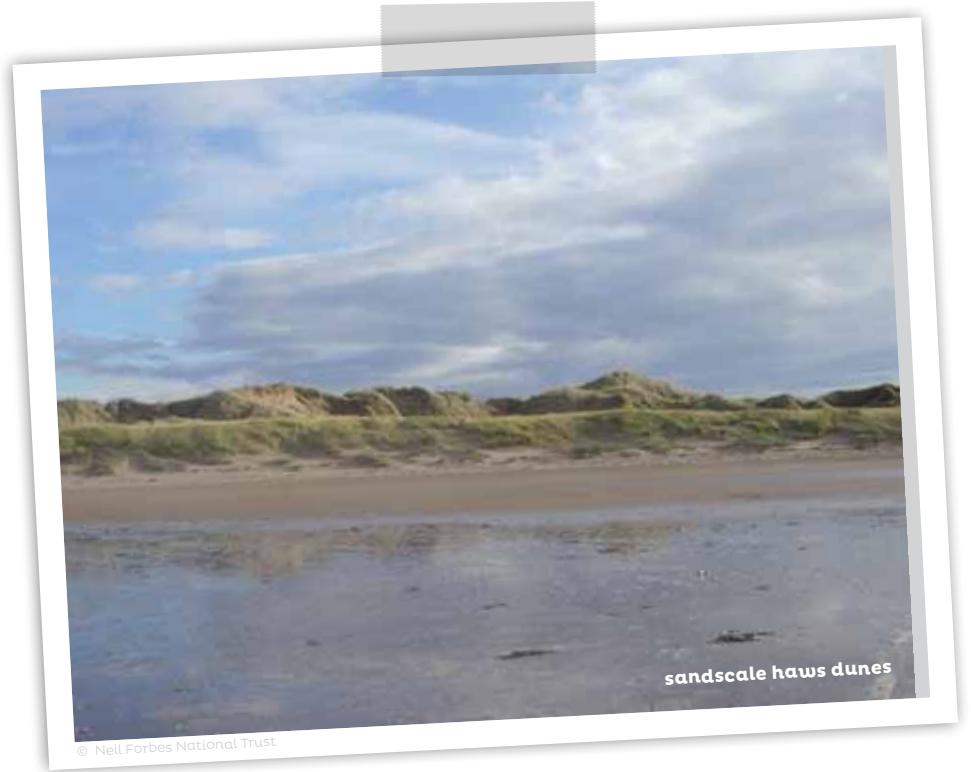
sandscale haws dunes